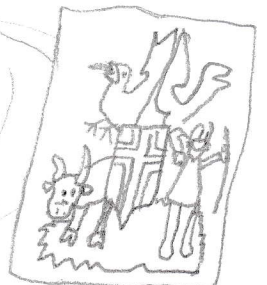
The Shield Bearer